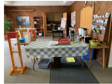
Ready to Serve!

If you are passing by Hope Chapel during the students' lunch hour, don't be surprised by the activity. The GTYM is loving the chance to be able to show care and kindness to our regional high school students, both those who attend CCI and OLB.